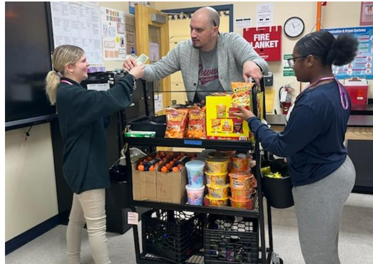
The ever popular "Caruso Cart" returns for the 2024 Hunger Games

Every year, FTC engages in what is fondly referred to as their version of the Hunger Games. It's not a battle for survival; rather, it's a symbol of the school coming together, a reminder of the challenges faced by so many within the community.