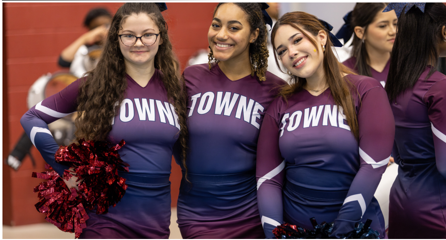
Members of the Cheerleading Squad performed at the event/ Photography Department