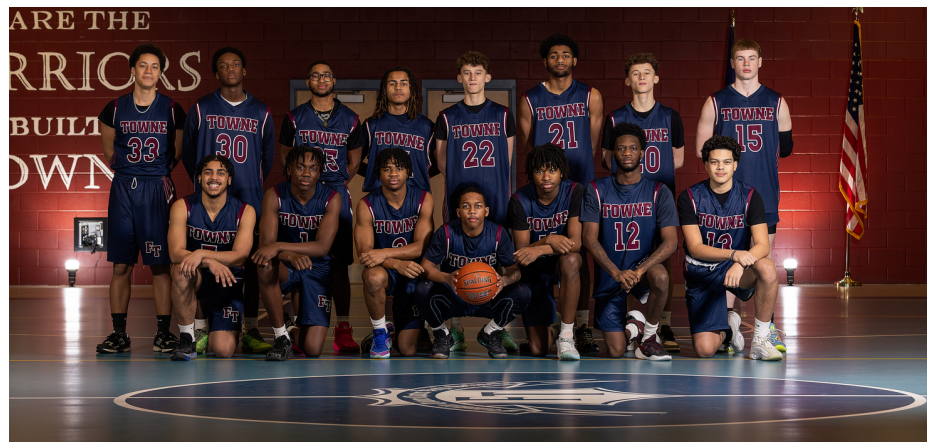
The 2023-2024 Boys Basketball Team