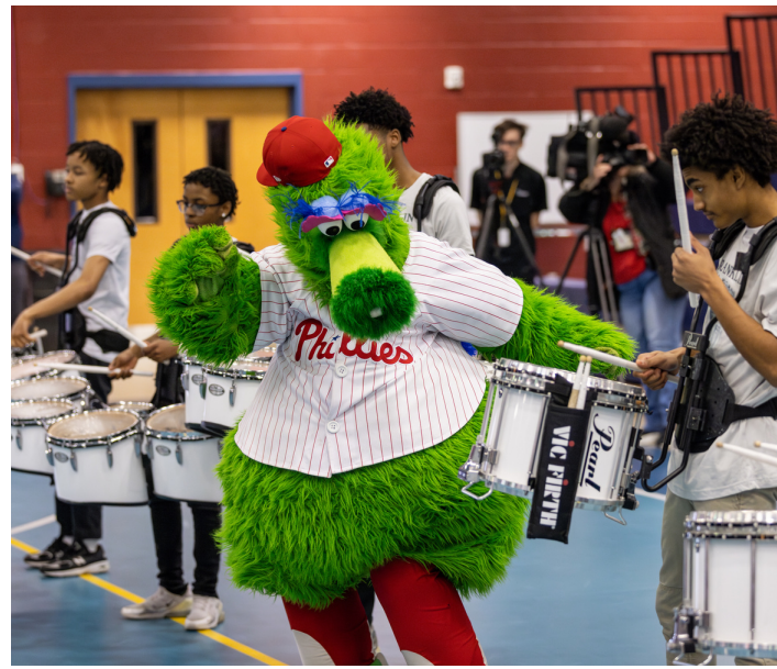
The Phillie Phanatic and Drumline