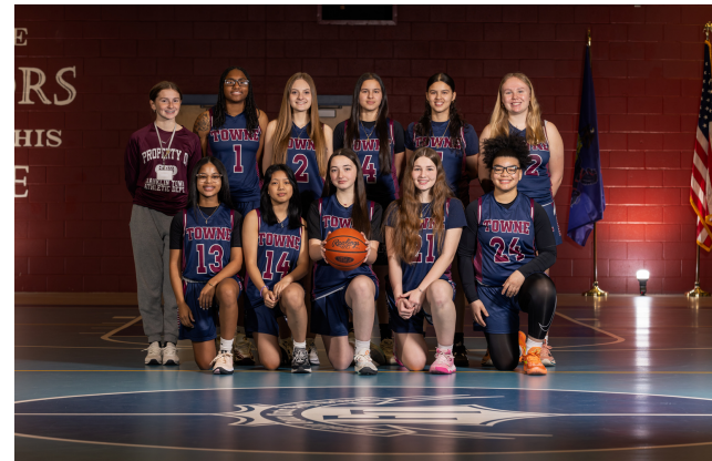
The 2023-2024 Girls Basketball Team