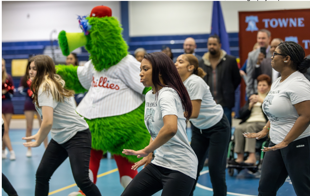
The Phillie Phanatic joins the Dance Team