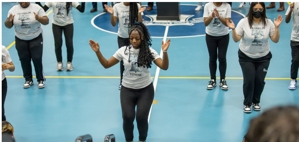
The FTCHS Step Team performs for local city officials, students and staff