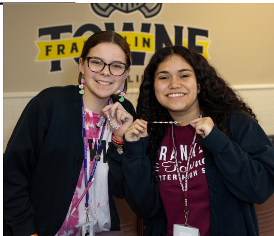
Students became friends and made sure to show it with their bracelets