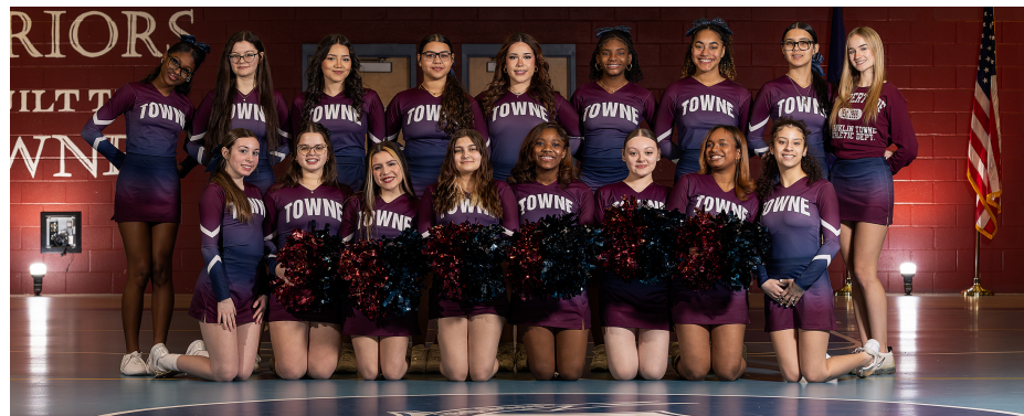
The 2023-2024 Cheer Team