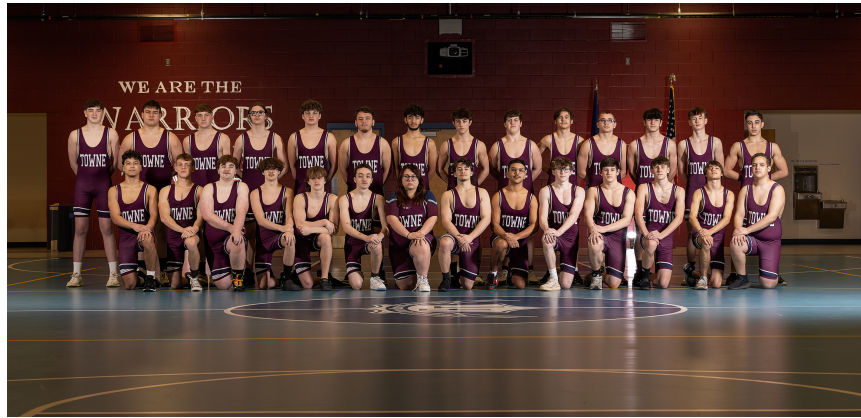
The 2023-2024 Boys Wrestling Team